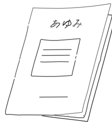
“Ayumi” -the evaluation report